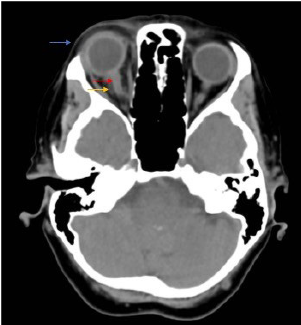
Figure 3: CT scan showing right eye proptosis (blue arrow), intraconal fat stranding (yellow arrow) and optic nerve thickening (red arrow).

Recognition of drug-induced ocular inflammation is critical to allow for prompt referral to an ophthalmologist and withdrawal of the drug in question. Patients receiving bisphosphonate treatment should be counselled to seek medical attention if they develop symptoms of visual loss, eye pain or eye redness.