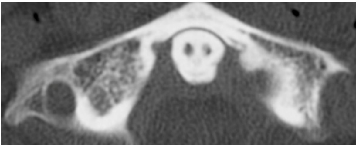
Figure 1: Grim Reaper appearance within radiograph of atlas bone of the neck.

T his article explores the rare—and entirely incidental—appearance of a Grim Reaper-like figure within a radiograph, highlighting the fascinating intersection of medical imaging and the tricks of human perception such as the psychological phenomenon of pareidolia. As part of a trauma scan following a road traffic accident, a rather chilling silhouette emerged from within the trabecular of an odontoid process. Despite the funereal appearance, no harm was caused by the accident and the patient was discharged home.